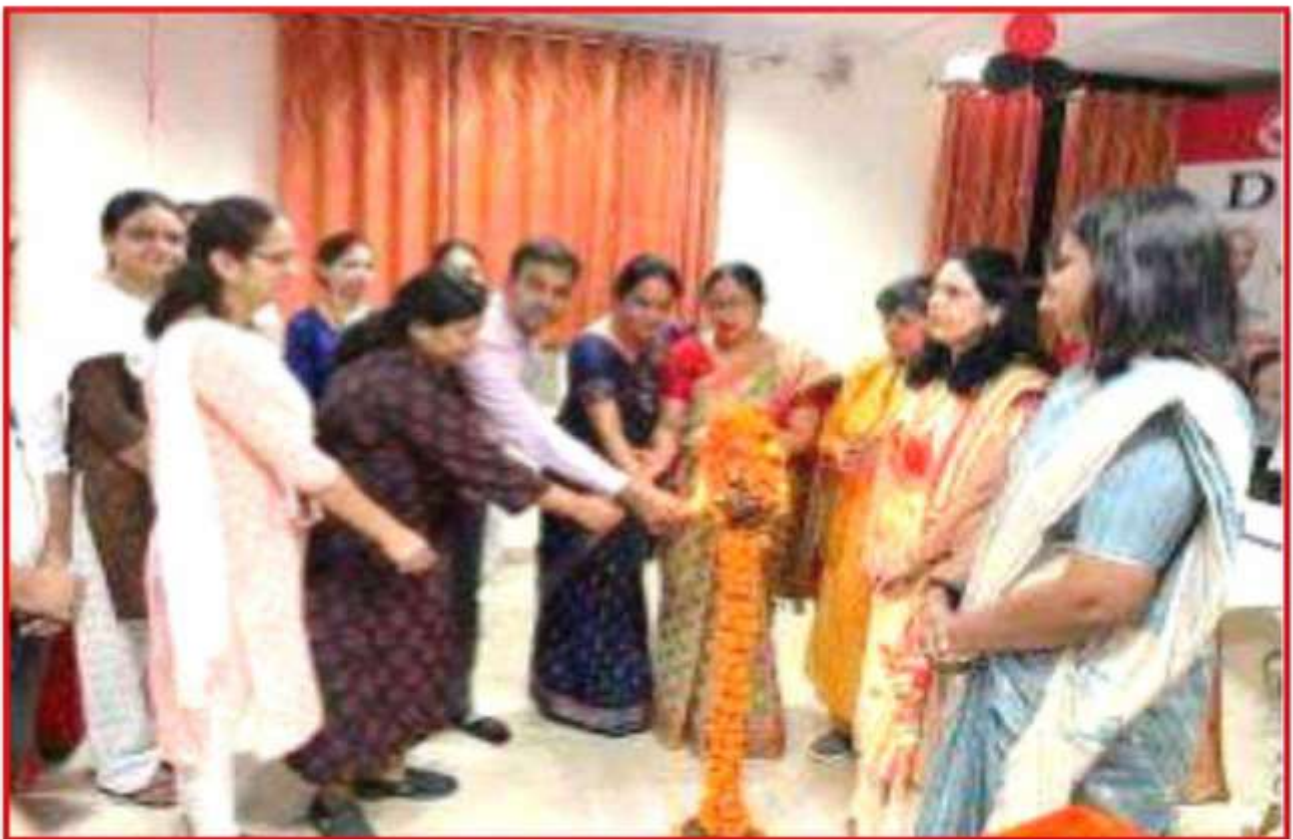
DHEERA- No violence against women