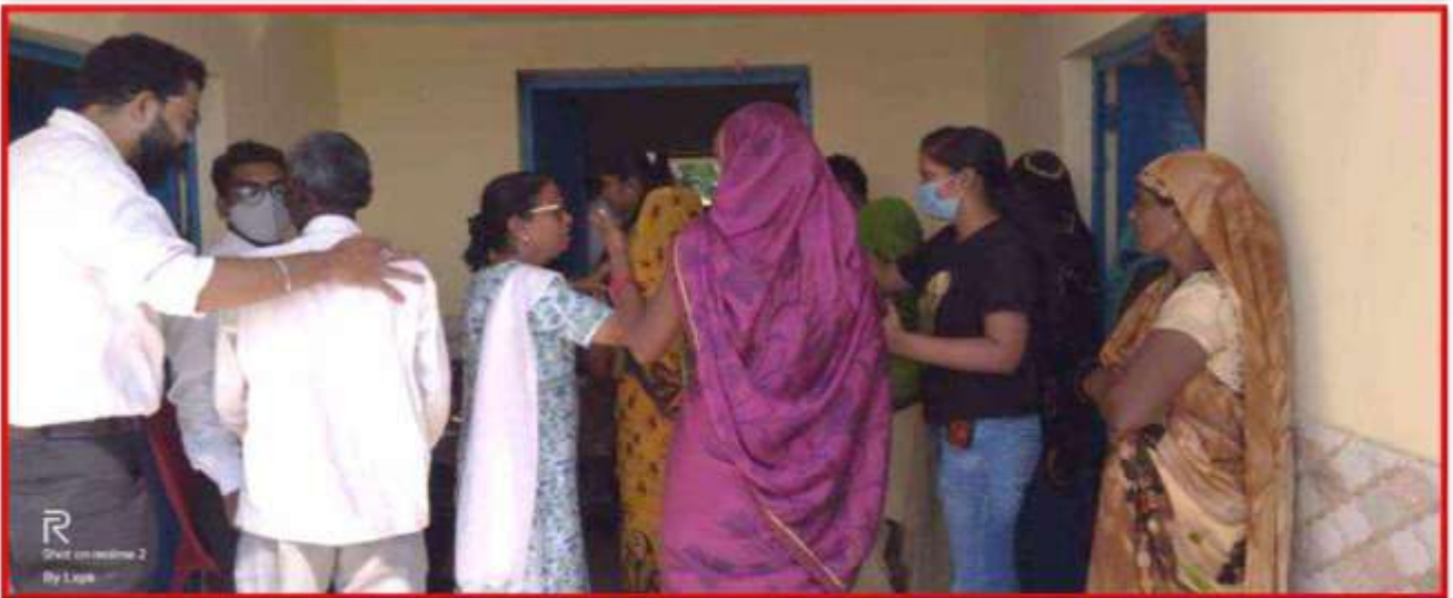
Health Check-up Camp at Panchayat Bhawan