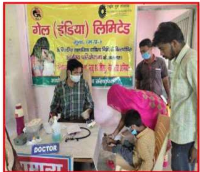
Health Camps in Madhya Pradesh