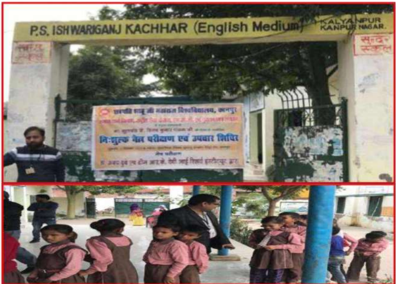
Eyes' Camp at Ishwariganj, Bithoor

Details of the Program: The Department of Social Work organized a Eyes' check-up camp with the support of NSS, NCC and University's Alumni Association in Ishwariganj Primary School and Village, Bithoor, Kanpur Nagar.