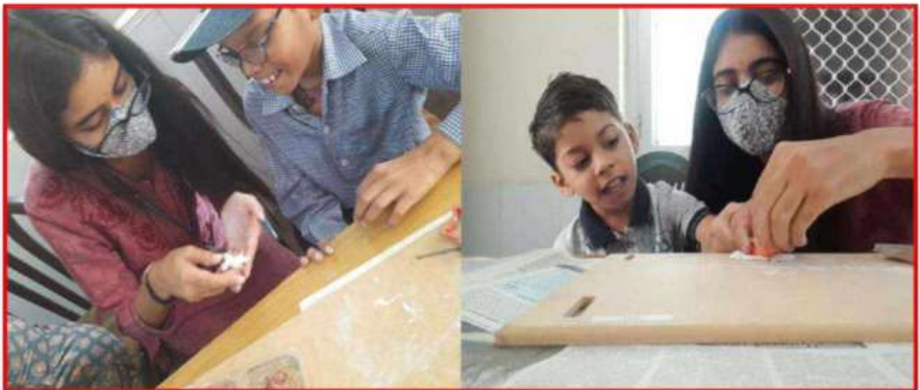
Ashaye in (formerly the Spastics Centre)

Details of the Program: The center was initially established as a school for children with Cerebral Palsy no what students with other mental and physical disabilities as well. These children with special abilities are given education, physiotherapy, speech therapy and vocational training at the center. We have been working at the sheltered workshop section of the school for more than a year now and responsibilities involve to teach them, make them do several creative activities like cuttings ha perform ceramic ought, painting and coloring, making piles of donnas, decorating divas, making envelopes etc. It is a fact that these disorders they suffer from cannot be cured but we believe the reisstilla hope of them to evolve and learn new things even if it is as small as 0.001%.