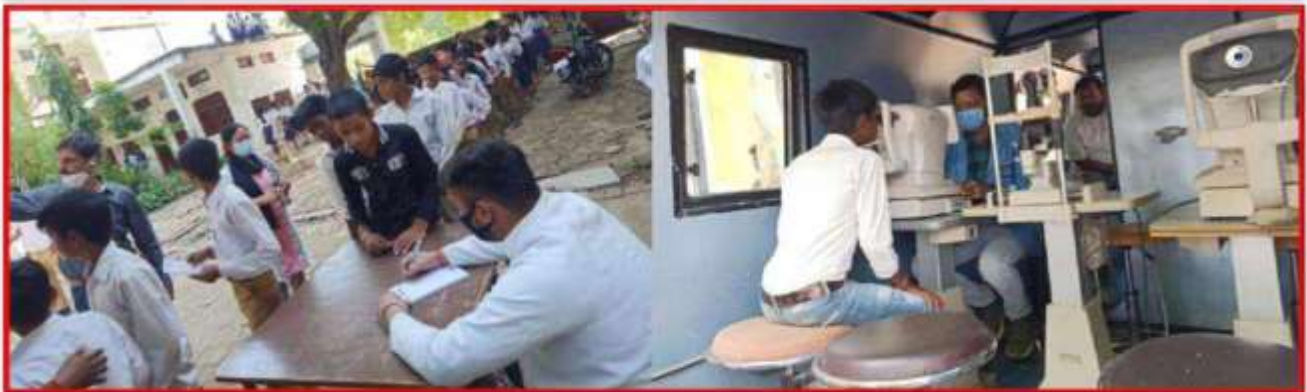
Health Camp at Baghpur Inter College