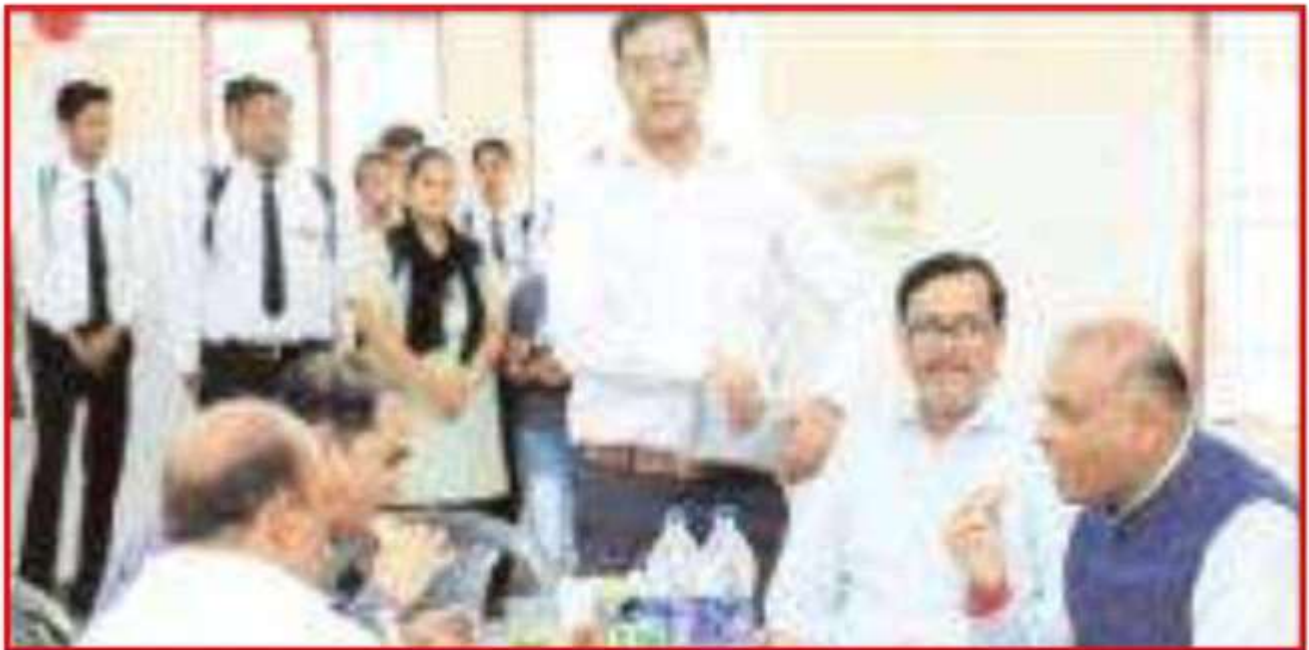
Three days Eye Test Camp

Details of the Program: The aim of this program is to provide maximum benefit to the general public from the activities of the university. In the same sequence, this "three-day free eye check-up camp" is being inaugurated. This camp will definitely benefit the general public living in the university campus as well as the surrounding rural areas.