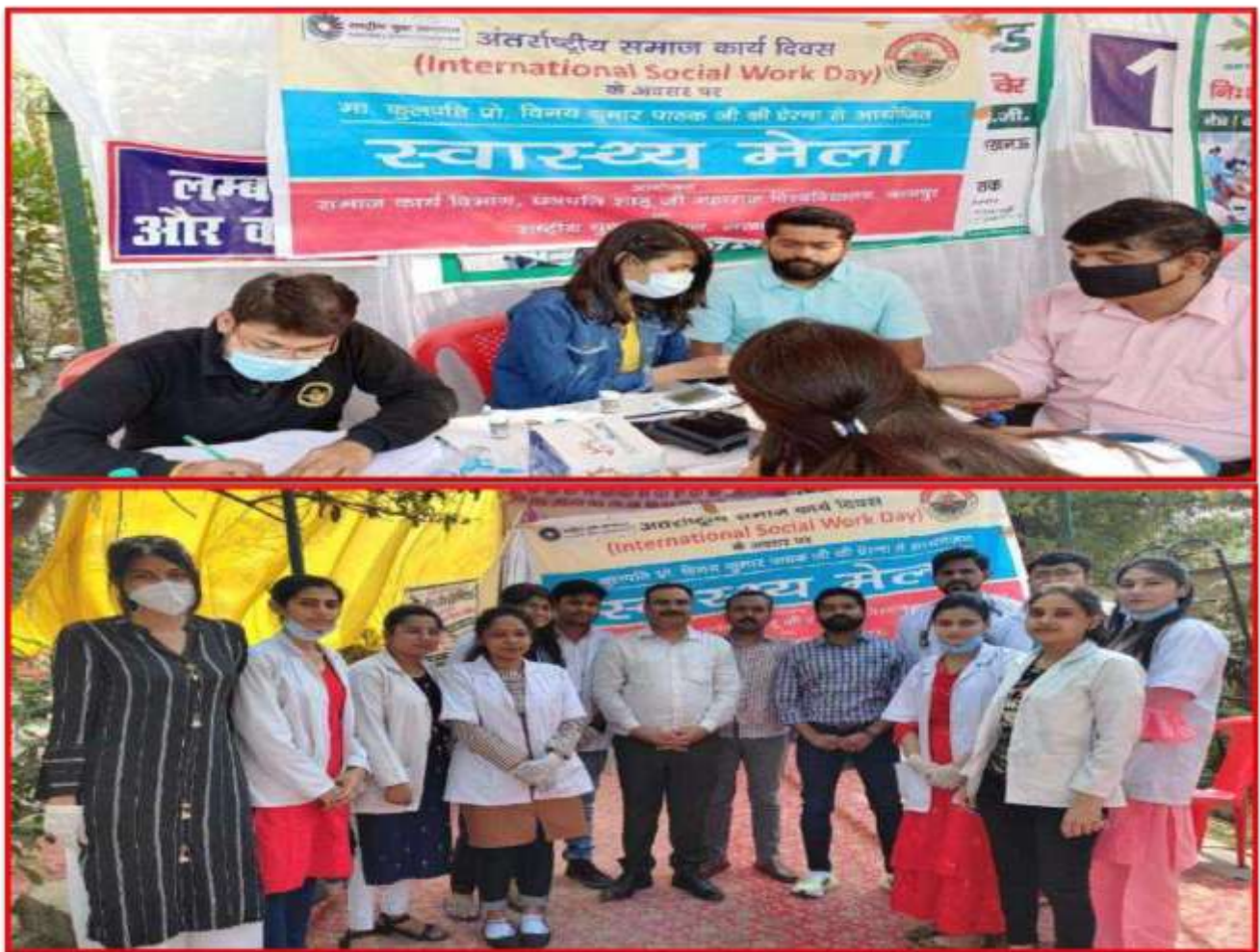
Health Camp in Lucknow

Details of the Program: The Department of Social Work and National Youth Foundation collaborate organized a Health Camp in Lucknow on the occasion of International Social Work Day.